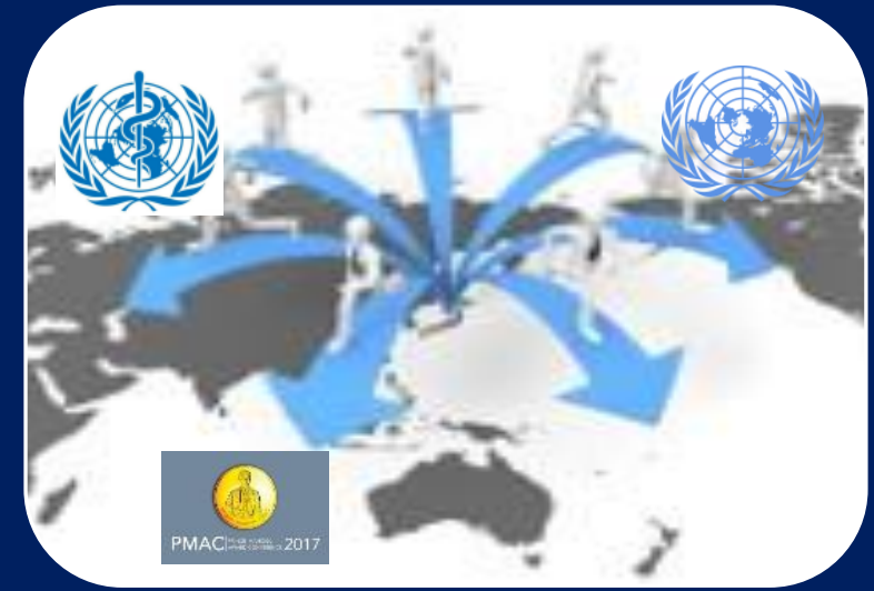
Contribution to global health