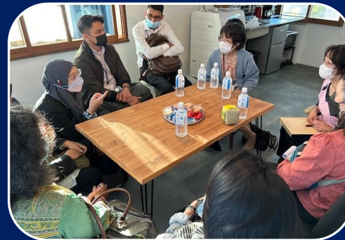
Study program in Japan