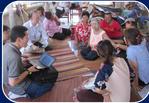
Practitioners