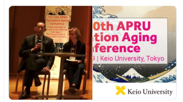
5:38 PM - Oct 20, 2019 - Twitter Web App