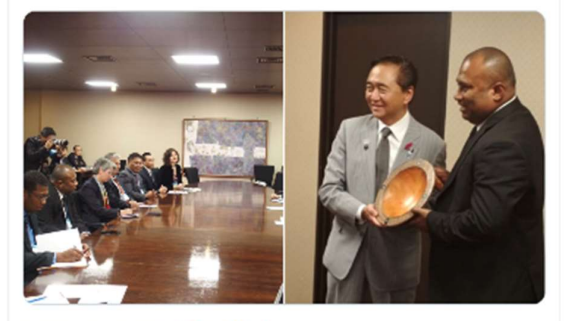
5:47 PM - Oct 20, 2019 - Twitter Web App