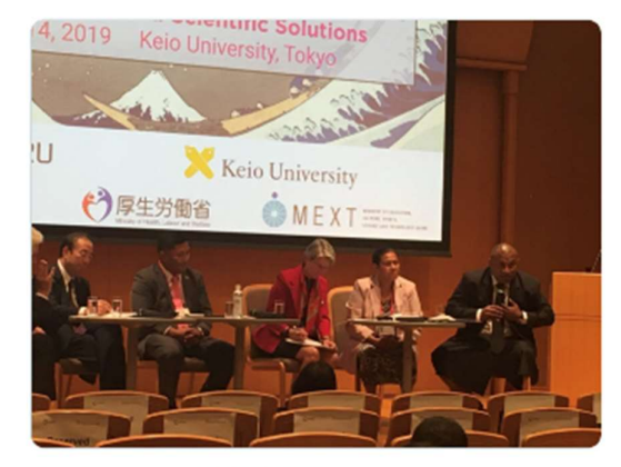
5:39 PM · Oct 20, 2019 · Twitter Web App

In a discussion on healthy <u>#ageing</u> between ministers of health from the <u>@WHOWPRO</u> Region at the <u>@APRU1997</u> conference, <u>#Fiji's</u> <u>@Drlfereimi</u> talks about how the "cultural fabric" protects and ensures respect of older people.